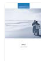
User manual 900-098