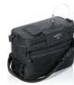
Black carrying case 900-200